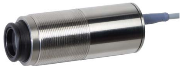
Polaris -Infrared Switch in stainless steel housing