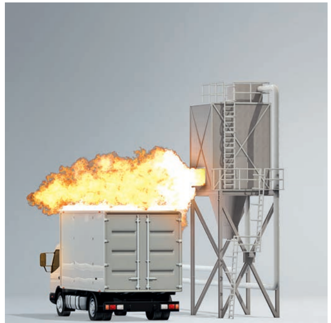
Without TARGO-VENT: The flame endangers operating areas.

Consulting. Engineering. Products. Service.