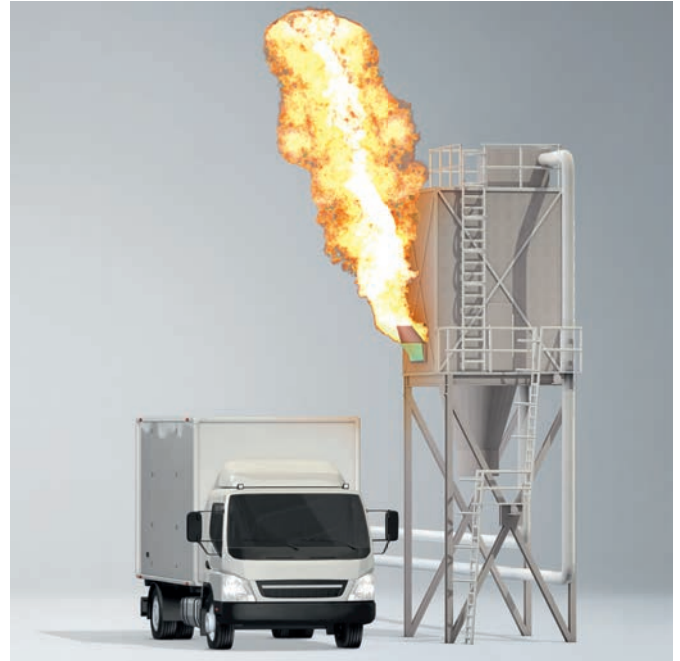
With TARGO-VENT: The flame is deflected into safe areas.